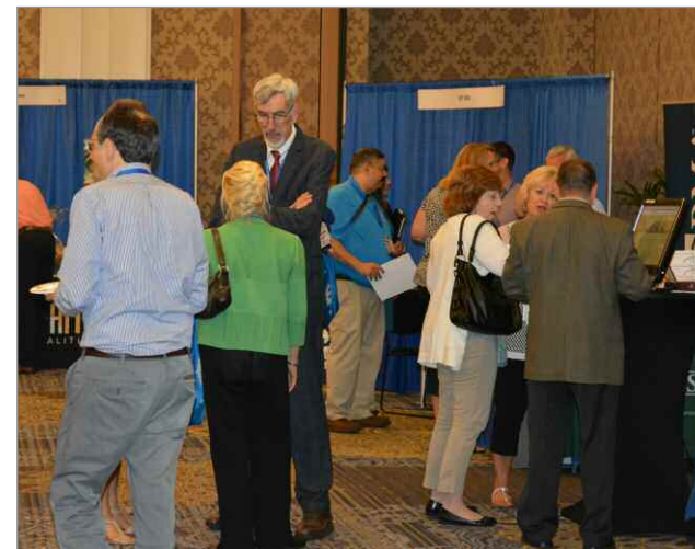
2018 Exhibit Hall in Memphis (both images)