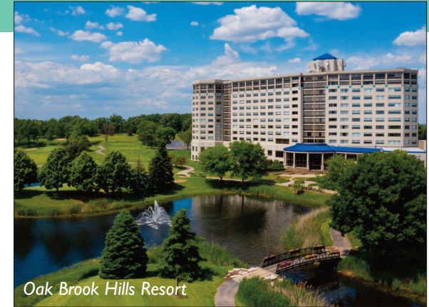
Oak Brook Hills Resort