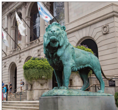
Art Institute of Chicago