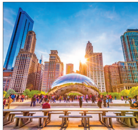
Cloud Gate (the Bean), Millennium Park