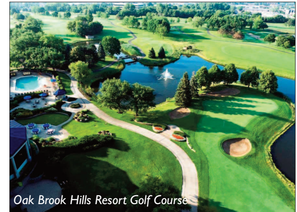
Oak Brook Hills Resort Golf Course