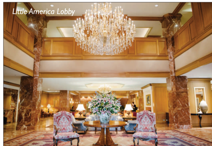
Little America Lobby