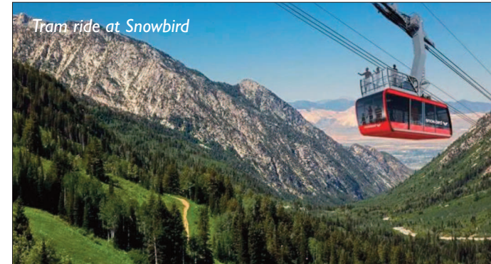
Tram ride at Snowbird

If you're wondering about our conference logo, once you're in Utah, you'll see bee and hive logos everywhere. Utah is known as the beehive state, not because of actual honey production, but because of the history of industry in the Utah community, with each person working together to support and help one another. We hope you'll join us in celebrating Utah as we enable our attendees to "Bee Inspired."