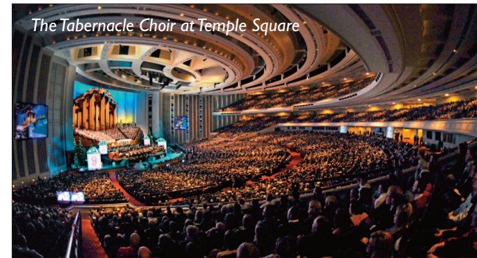
The Tabernacle Choir at Temple Square